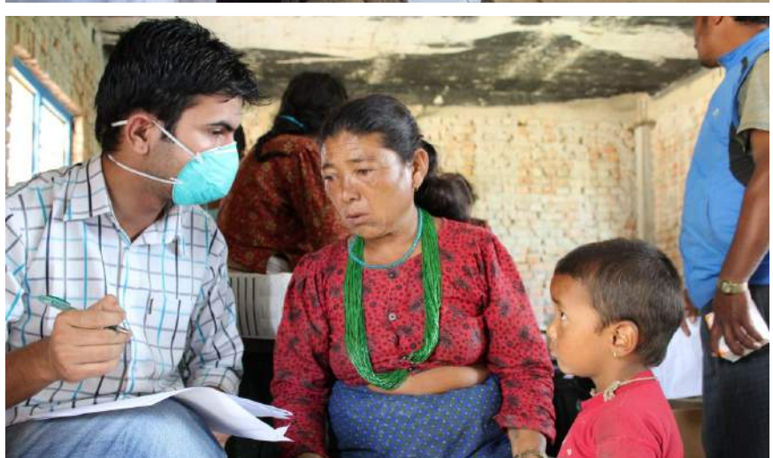
Figure 4. Health Camps

HELP NEPAL Network is working with the Department of Education to redesign schools damaged by the earthquake. Several schools have been selected in Sindhupalchowk and Nuwakot for reconstruction, and the initial design and costing phase is underway. We plan to complete this phase and begin the reconstruction work in the coming months. Our reconstruction work in 2016 will primarily focus on rebuilding schools.