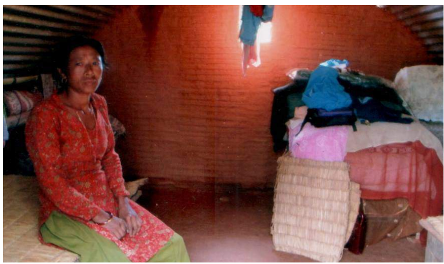
Figure 2. Temporary Shelter

Shelters, Learning Centers, Latrines & Health Camps